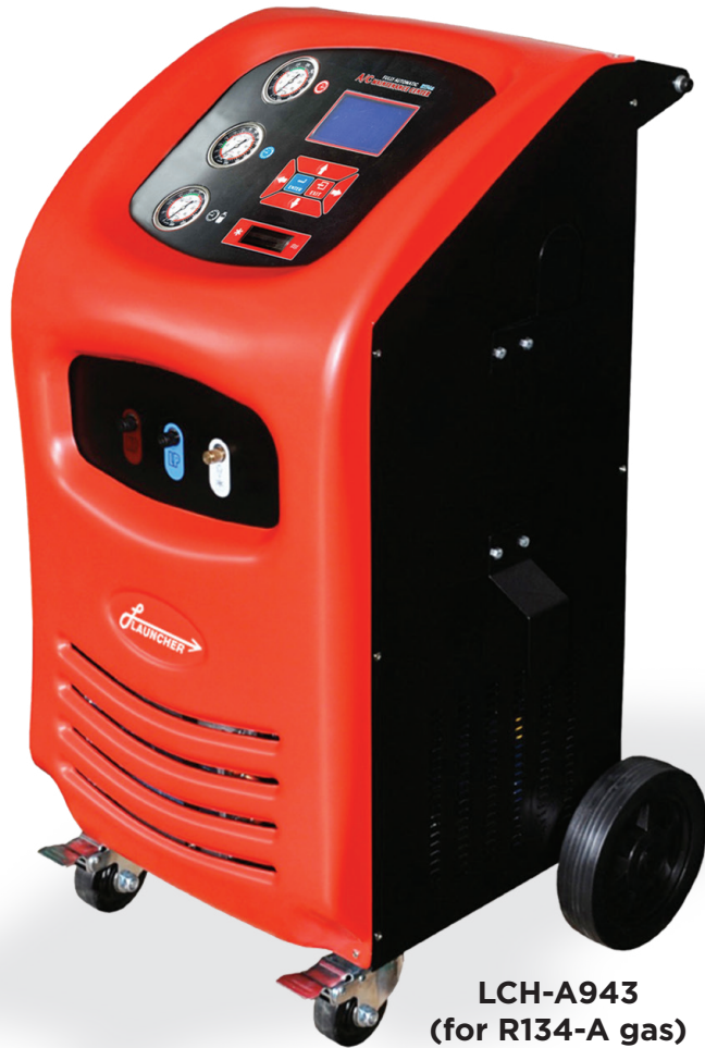
LCH-A943 (for R134-A gas)