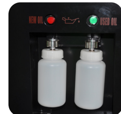
Oil Injection Controlled by Switch