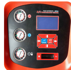
Friendly Interface Run by Hot Key