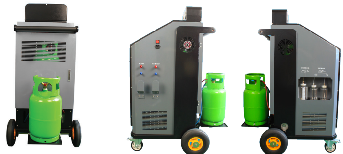
Isolated supply tank location to avoid contamination