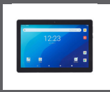
HAND-HELD EXTRA SCREEN (OPTIONAL)